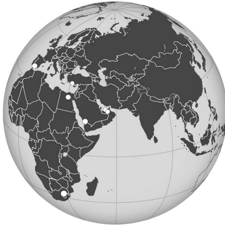
Fig. 3. Distribution of Pseudoleria pectinata in the Old World.

lomere is small, flag-cheek ratio ca. 0.5. Pronotum distinctly paler than the mesonotum disc (yellowish-brown in colour). Bases of dorsocentral setae with small spots only, the median vitta, not well seen]. The characteristics of male and female genitalia of both species are well described and keyed out by MCALPINE (1984) and WOŹNICA (1993).