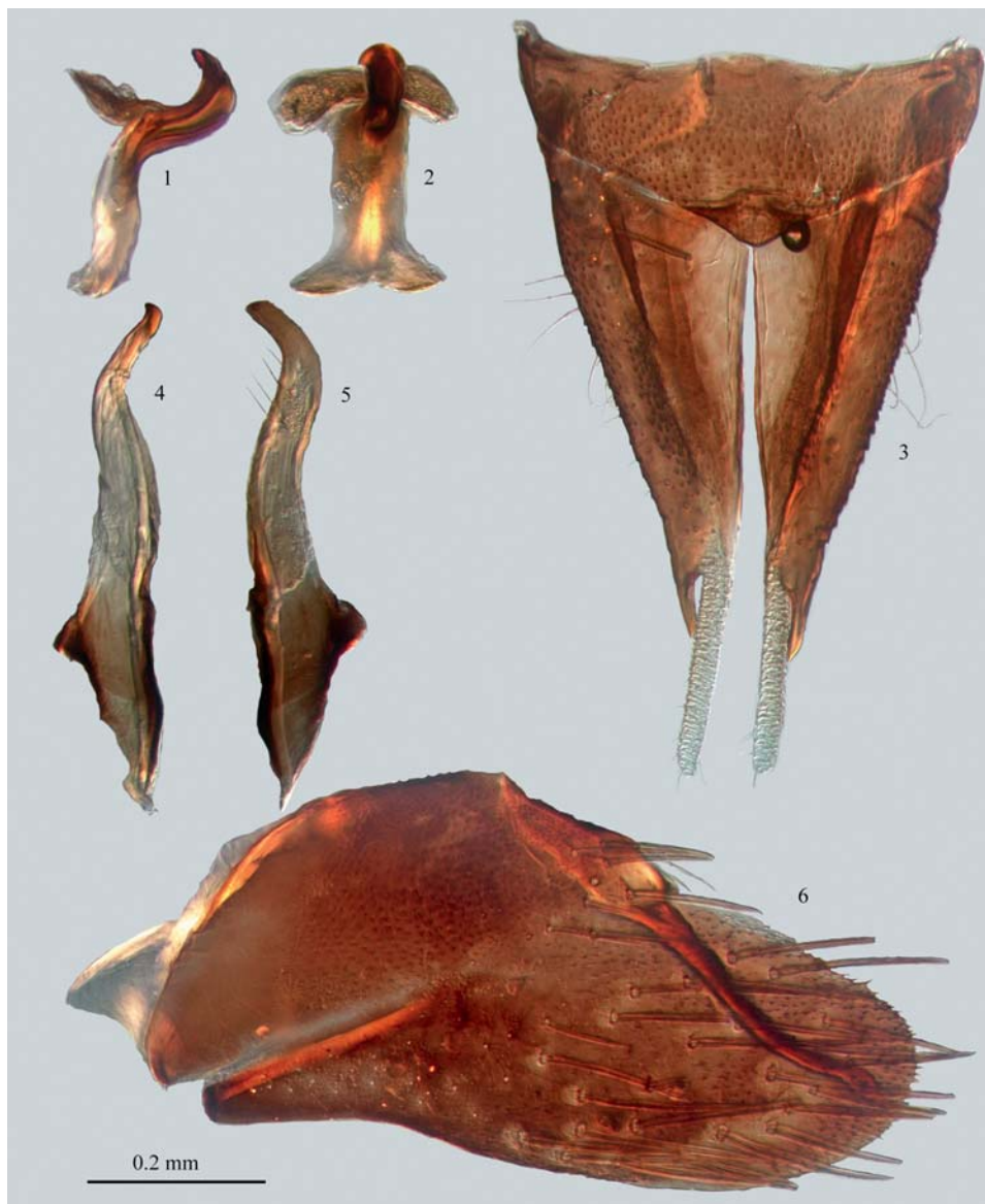
Fig. 3. Apex of male abdomen of Orientus ishidae : aedeagus, lateral view – 1; aedeagus, posterior view – 2; abdominal sternite, genital plates and valves, ventral view – 3; right genital style, lateral view – 4; right genital style, dorsal view – 5; pygofer with process, side view – 6.

10 VII 2014: 1♂, sticky trap for catching grey larch tortrix ( Zeiraphera griseana (Hüb.)) hung in a 100-year old spruce stand, Bruder D. leg., Klejdysz T. det. et coll.;