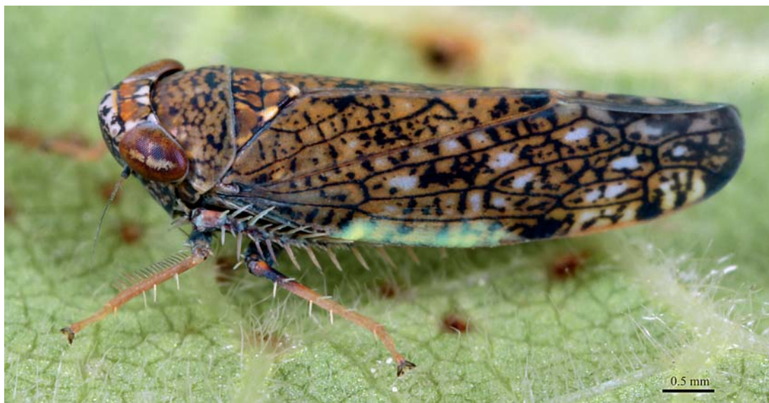
Fig. 1. Mosaic leafhopper – Orientus ishidae on a hazel leaf ( Corylus avellana ) in Poznań, Poland

the following European countries: Czech Republic in 2004 (Malenovsky and Lauterer 2010), Austria in 2007 (Nickel 2010), France in 2009 (Callot and Brua 2013), Hungary in 2010 (Koczor et al. 2013), Great Britain in 2011 (Anonymous 2012), Slovenia (Jurc 2010), Switzerland (Günthart and Mühlethaler 2002) and Germany in 2002 (Nickel 2010). There is some information posted on internet forums on the occurrence of O. ishidae in Belgium, Slovakia and Spain (Anonymous 2015).